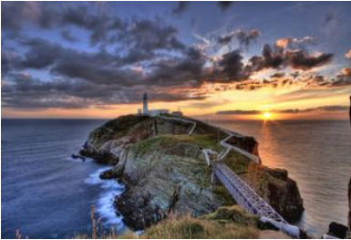
South Stack Lighthouse

South Stack is an island situated just off Holy Island on the North West coast of Anglesey and the home of one of Wales' most spectacular lighthouses.