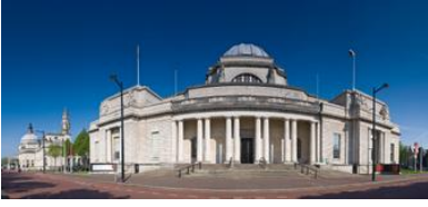
National Museum Cardiff

The National Museum in Cardiff is an art gallery and museum charting Wales' history. The museum is home to the Welsh national collection of fine art and applied art as well as European art by famous artists like Monet, Van Gogh, Renoir and Cezanne.